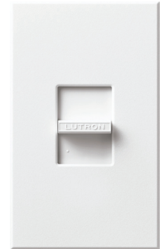
Lutron Nova lighting control

that contribute to the creation of healthy environments for all.